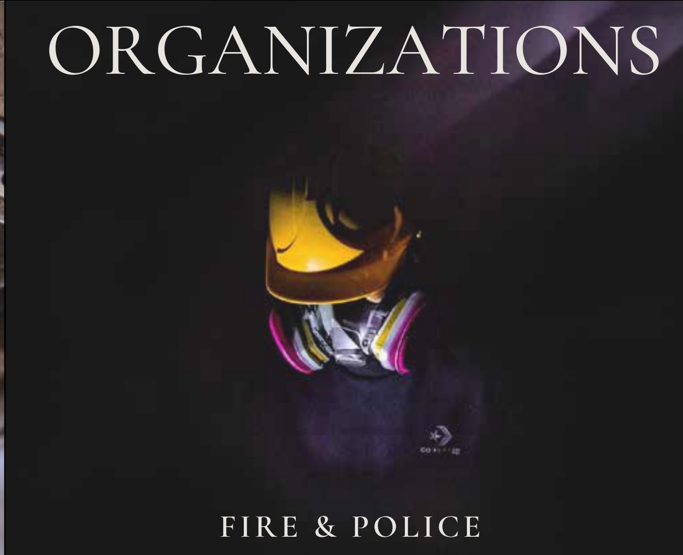
FIRE & POLICE